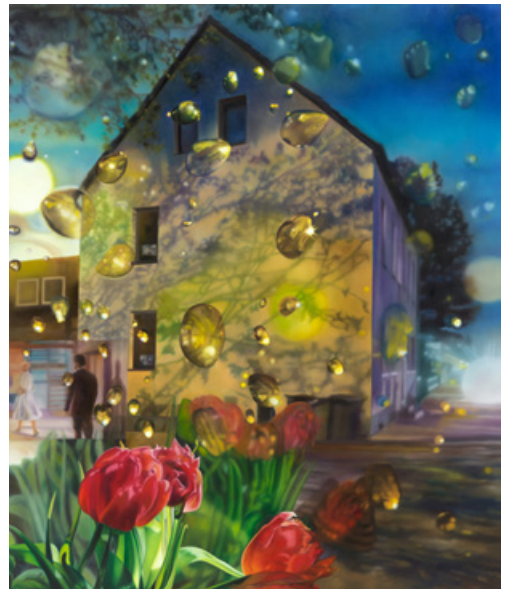
Press image 2 Karin Kneffel, Untitled , 2021, Oil on canvas, Private collection, © VG Bild-Kunst, Bonn 2022