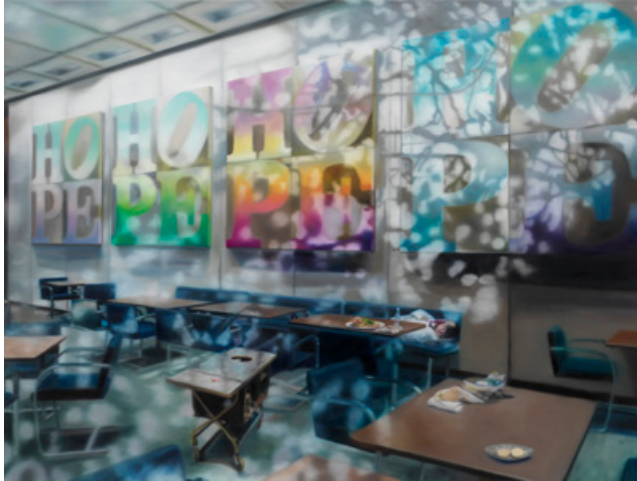
Press image 1 Karin Kneffel, Untitled , 2016, Oil on canvas, Private collection, © VG Bild-Kunst, Bonn 2022