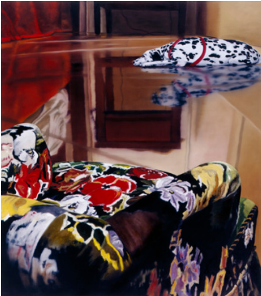
Press image 4 Karin Kneffel, Untitled , 2007, Oil on canvas, Private collection, © VG Bild-Kunst, Bonn 2022, photo: Achim Kukulies, Düsseldorf