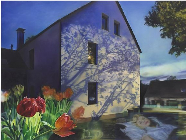
Press image 10 Karin Kneffel, Untitled , 2019, Oil on canvas, Private collection NRW, © VG Bild-Kunst, Bonn 2022, photo: Achim Kukulies, Düsseldorf