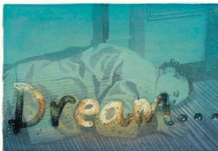
Press image 3 Karin Kneffel, Untitled , 2014, Watercolor, Private collection, © VG Bild-Kunst, Bonn 2022