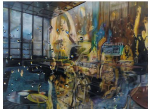
Press image 8 Karin Kneffel, Untitled , 2012, Oil on canvas, Private collection Langen, © VG Bild-Kunst, Bonn 2022