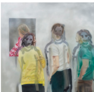
Press image 6 Karin Kneffel, Untitled , 2016, Oil on canvas, Private collection, Hamburg, © VG Bild-Kunst, Bonn 2022, photo: Achim Kukulies, Düsseldorf